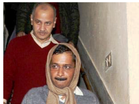
"We are just a group of IITians who are against the policy of AAP. We don't officially represent IIT," a disclaimer says.

Kolkata: A new page has been started on Facebook by students of the Indian Institute of Technology, Kharagpur (IIT-Kgp), of which Delhi Chief Minister and Aam Aadmi Party (AAP) chief Arvind Kejriwal is an alumnus, decrying the policies of the AAP.